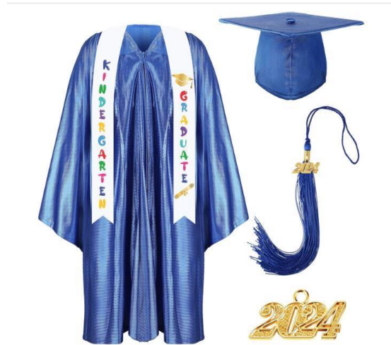
2024 Year Preschool and Kindergarten Graduation Gown Cap Tassel Set with 2024/2025 Charm Printed Stole